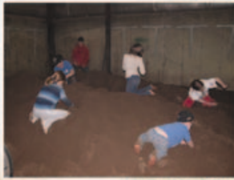
When the clowns can't go away for the winter, they have a "winter picnic." The children of clown members digging for presents was one of the activities at this year's event.