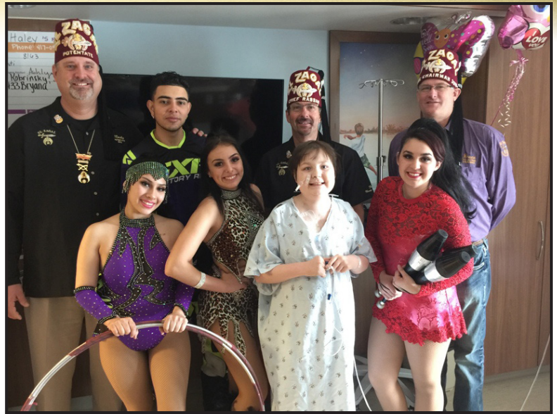
Visit to Sanford Hospital Children's Unit