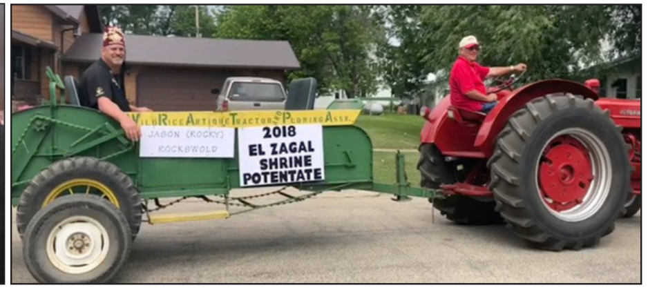
Pote in manure spreader