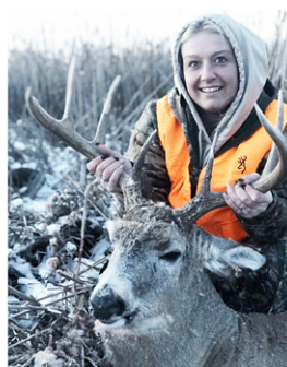
LADY TIFFANT'S BIG BUCK

A One Day Masonic Class was held on October 20th in Wauben, MN. Sounded like that was an awesome day as we helped create some 44 new Masons in the region! On December 1st Shiloh Lodge #1 is putting on a one day Street to Shrine Class in Fargo. This is an excellent time to finish up degree work and become a Shriner. After the Street to Shrine we will head, with all the new Shriners, to Jamestown for their Clown for a Night. What a great day this will be!