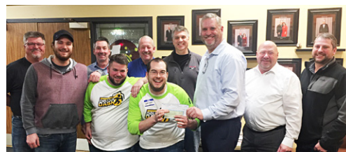
DRUNK DASH RAISES BAR: RECORD DONATION ($4640.00) TO HOSPITAL TRANSPORTATION FUND