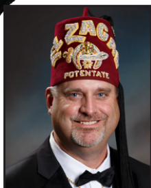
Greetings Nobles and Ladies...

Fun and fellowship are the foundations of our fraternity. This was again proven true as we struck out in the bitter cold of February, headed for historic Deadwood, SD for the Midwest Shrine