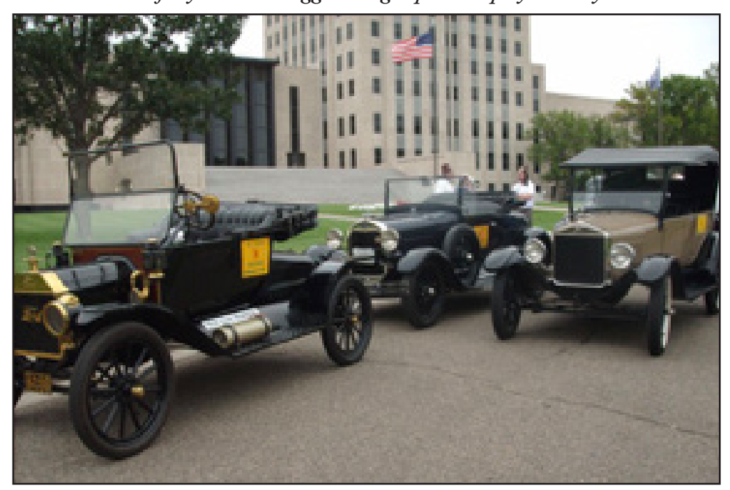
Duster Cars Lining up for Parade on ND Capital Grounds Fall Ceremonial