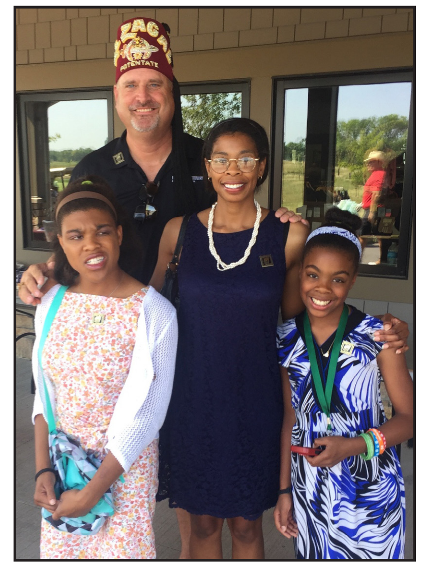
Shrine Patient & Family at Pro / Am Tournament