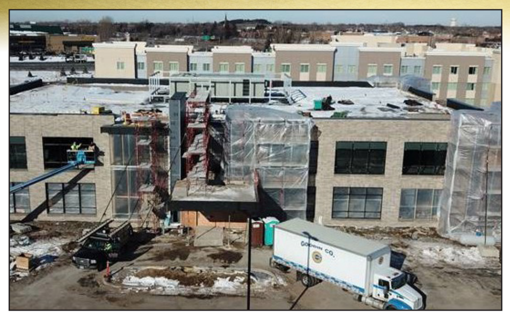
Shriners Healthcare Clinic in Woodbury, MN.