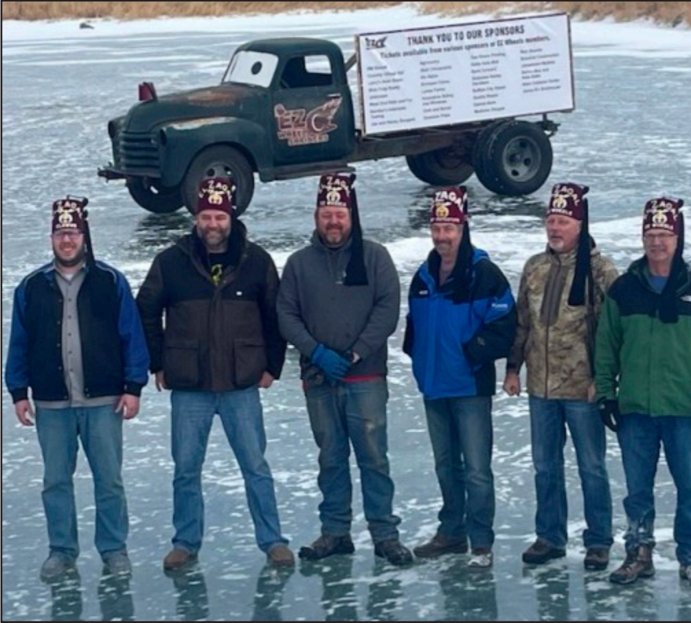
Above is a picture of some ugly EZ Wheel members on the Little Britches Pond in Jamestown.

In the background is our beautiful truck that we secured for our 1st Annual EZ Wheels Truck Drop. For $5 a ticket you can guess when the truck is going to drop thru the ice. If it doesn't start warming up again it might be the 4th of July. We are busy selling tickets and would love to hook any of you illustrious Shriners up with a winning ticket. Lucky guesser wins $2000.