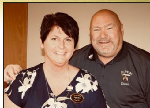
Potente and Lady Bonnie