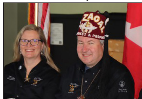
High Priest and Prophet