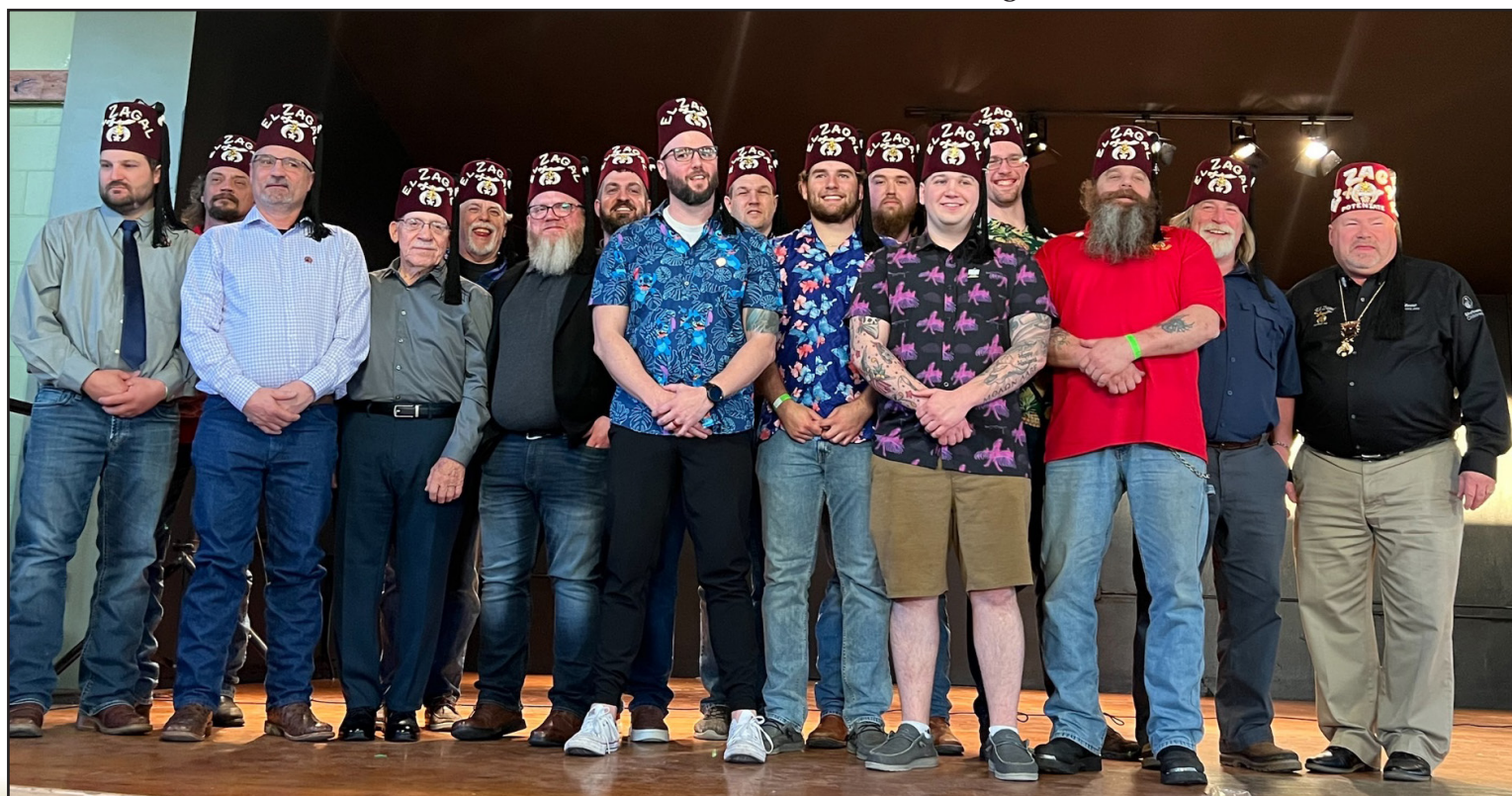
New Nobles at DL Ceremonial