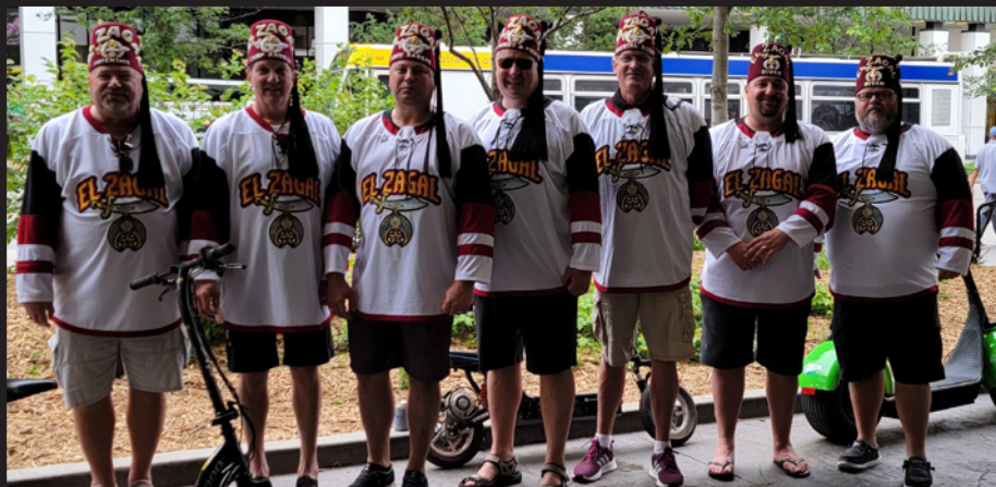
Divan at Imperial