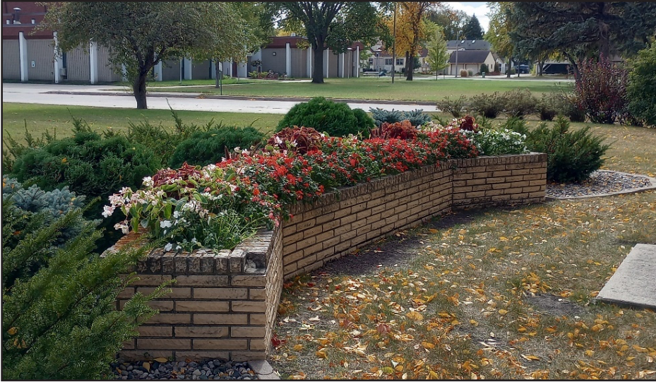
A huge Thank You to Noble Chad Dubuque of the Big Band and Lady Shauna for their diligent efforts to clean up and plant the flower bed by the Statue in front of the Temple.