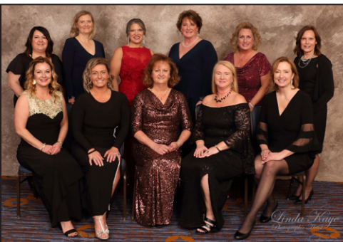
2023 Divan Ladies