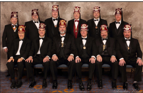
2023 El Zagal Divan