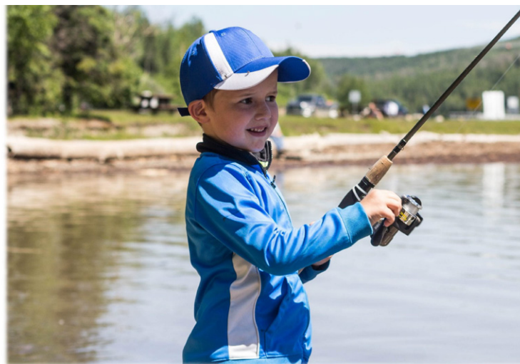
Shriners having fun helping kids

Pelican Point Landing and Resort – Jamestown August 12 th 2023