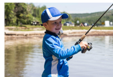
Shriners having fun helping kids

Pelican Point Landing and Resort – Jamestown August 12 th 2023